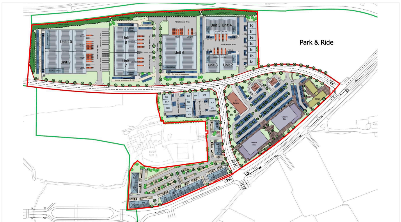
Indicative Masterplan - subject to planning